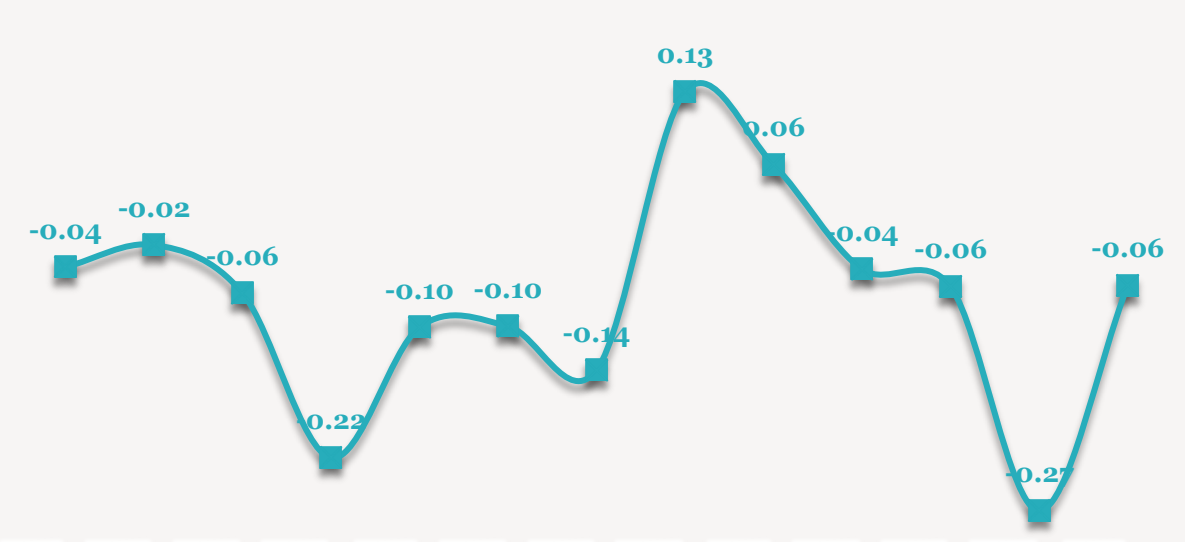
1Q22 \ 2Q22 \ 3Q22 \ 4Q22 \ 1Q23 \ 2Q23 \ 3Q23 \ 4Q23 \ 1Q24 \ 2Q24 \ 3Q24 \ 4Q24 \ 1Q25