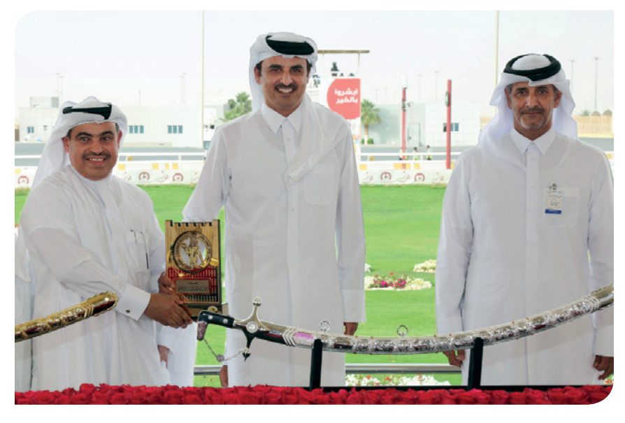
Above: Sponsoring the iconic Camel Race Festival for the Sword of H.H. the Amir.

"Over the years, our volunteers have supported a wide range of community projects, including fundraising, keep-clean rallies, financial education initiatives, mentoring and training, coaching a children's sports team and even providing a warm meal to those less fortunate."