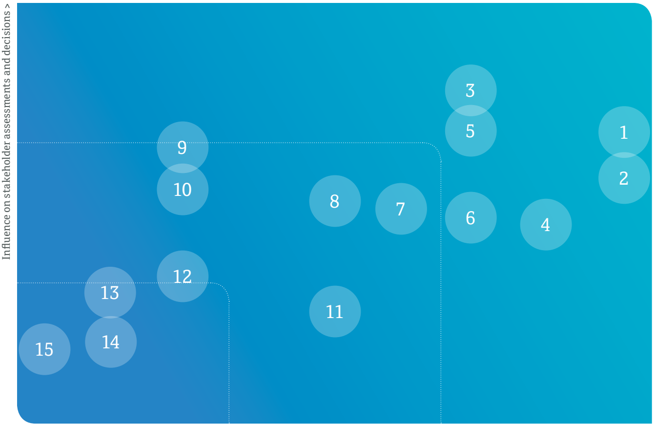
Significance of impacts >